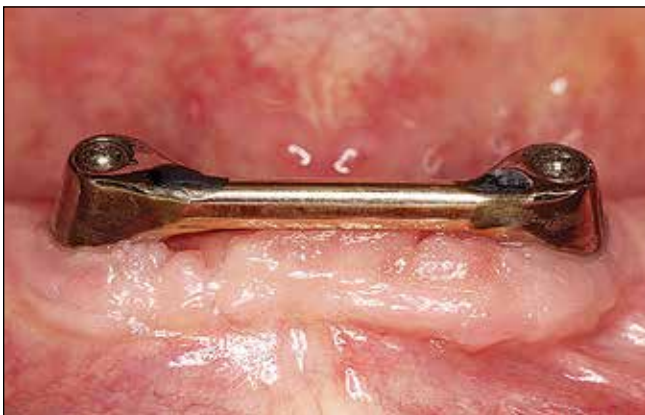
Fig. 3. Optimal distance of approximately 25 mm between implants for a bar design.