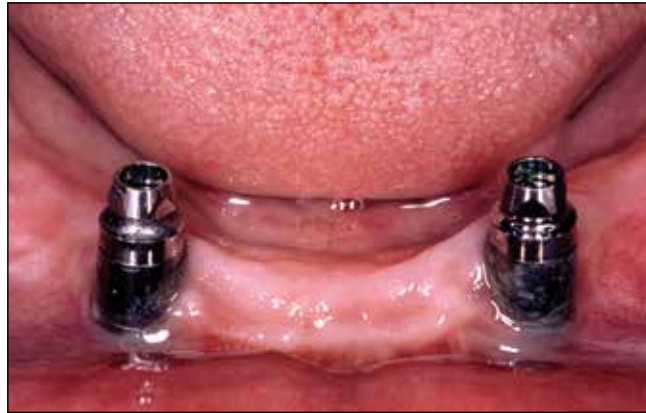
Fig. 2. Implants placed at lateral-canine sites.