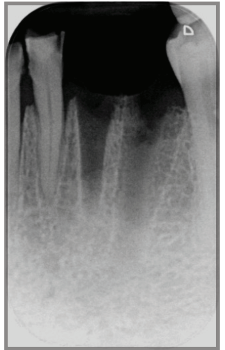
Figure. Conventional periapical dental radiographic appearance of medication-related osteonecrosis of the jaw for a patient treated with intravenous bisphosphonate. Note the thickening of the lamina dura, moderate bony sclerosis, and osteolysis in the socket.

10,000) in osteoporosis patients treated with antiresorptive drugs. ^{\scriptscriptstyle 35}