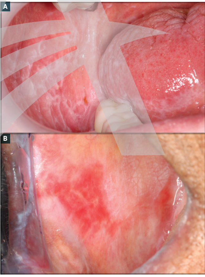
Figure. A. Clinical appearance of reticular lichen planus affecting the buccal mucosa and lateral tongue. B. Erosive lichen planus affecting the buccal mucosa.

ral lichenoid disease encompasses a variety of clinical and histologic presentations, including classic oral lichen planus (OLP), which generally appears as symmetric white striated lesions or atrophic or ulcerated lesions with accompanying white striae (Figure).¹ In addition, oral lichenoid lesions (OLLs) may arise in reaction to systemic medications (also known as oral lichenoid drug reactions [OLDRs]) or localized irritants or allergens such as dental restorative materials or flavoring agents (also known as oral lichenoid contact reactions [OLCRs]).¹ OLLs often appear as unilateral or solitary lesions that may not fulfill all of the clinical or histopathologic features of OLP.¹² In many cases, the difference between OLP and OLLs cannot be determined with certainty either clinically or histologically.